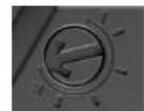
audio mix control

Note: The line level audio mix control is located on the back side of the unit next to the mode selection switch.