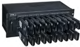
20-Unit Charging Tray