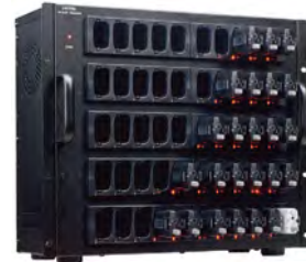
50-Unit Charging Tray