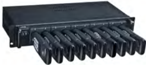
10-Unit Charging Tray