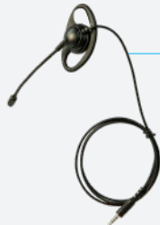
LA-451 Headset 1-ear speaker with boom mic