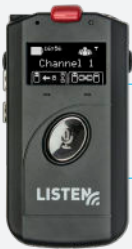
LK-1 ListenTALK Transceiver