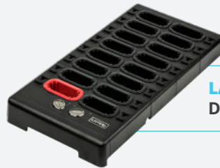
LA-480 Docking Station