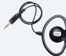
LA-401 Universal Ear Speaker